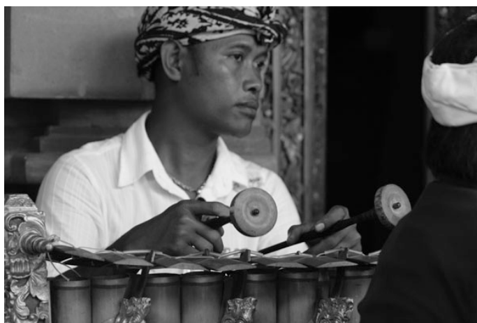
Figure 3: bronze keyed metallophone used during Balinese sapu leger healing ritual

Music offered during sapu leger draws from the shadow puppet repertoire called wayang kulit , a shadow puppet theatre with one puppeteer and up to four musicians. The repertoire is not ritual specific. However, when coupled with the sapu leger context, its potentiality expands to become an interdependent sonic link between the cognitive mind frame of participants and the pantheon of Hindu deities. As 'cognitive collaborators', musicians play percussion instruments made of bronze metal keys suspended over bamboo resonators.