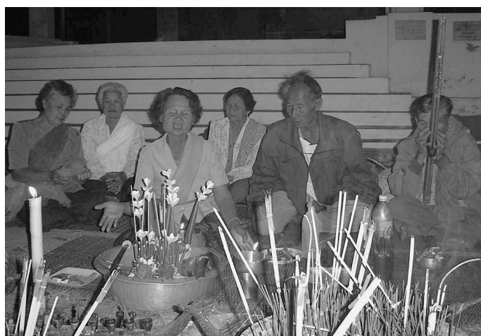
Figure 1: Northern Isan Khaen player accompanying Phee Faa healer

One such case study demonstrating this multitude is the Phee Faa healing ritual from the Northern Isan region of Thailand. In the ritual, a medium facilitates healing with the aide of an indigenous musical instrument called khaen . The khaen is a kind of mouth organ constructed from eight slender bamboo tubes, each containing a brass free-reed that vibrates when air passes through a central hollowed out hardwood reservoir (Figure 1). A khaen player blows into the reservoir and controls air circulation with his fingers and thumbs, activating airflow to chambers via finger holes to facilitate melodies. Crucial to the discussion here is the use of breath and the indigenous explanatory model among Isan that the khaen 's melodies bridge the realms of perceived reality, ancestral domains, and cognitive realms.